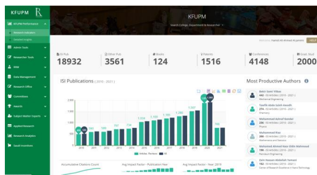
Figure 2. Snapshot of Abhathi® 1.0, used by KFUPM as a one-stop-shop for research dashboards, comprehensive project management, research resource management, researcher profiles, subject matter experts, committee management, and other services.

King Fahd University of Petroleum & Minerals (KFUPM) developed Abhathi 1.0, which is being used by Deanship of Research Oversight and Coordination since 2017. Abhathi can be accessed via https://research.kfupm.edu.sa/